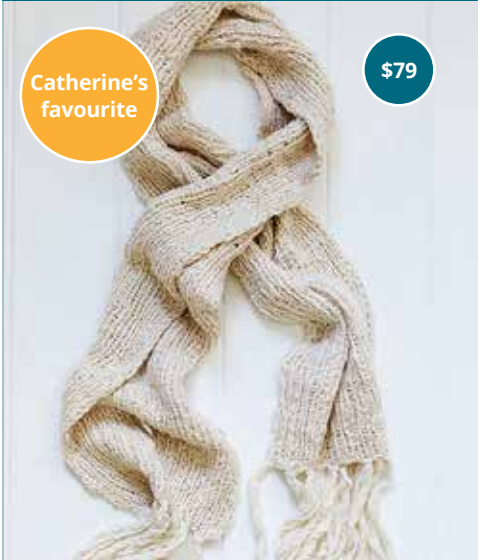
Brave & Beautiful Scarf