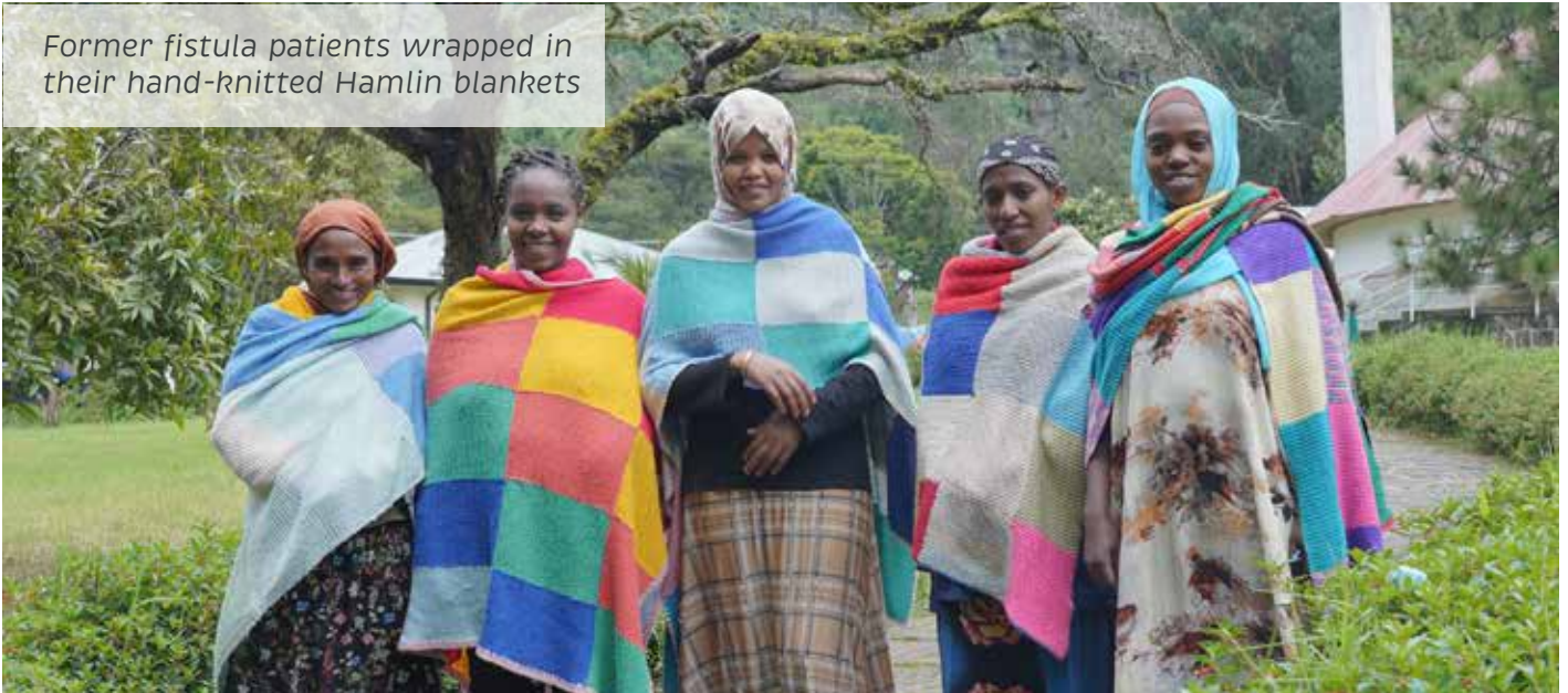
Former fistula patients wrapped in their hand-knitted Hamlin blankets

Visit hamlin.org.au/knit to see the knitting pattern and instructions.