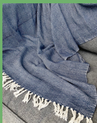
Mechot Throw: Navy (also in bronze, ivory)