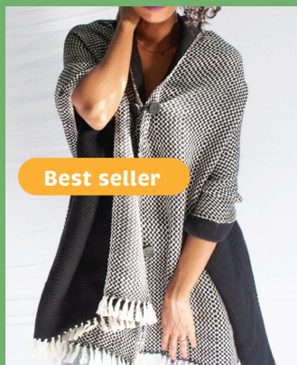
Kaba Cape (also in stone)