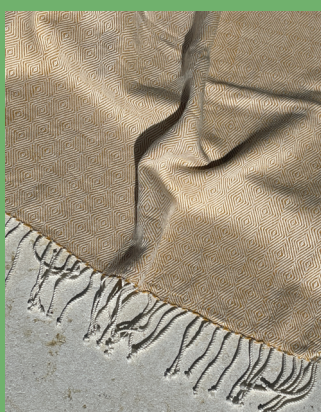
The Almaz Wrap: Gold (also in black, pink, mint)

The Hamlin shop has beautiful throws, wraps, capes and shawls to keep you warm, comfortable and cosy this winter. You will also find beanies, blankets, homewares, bags, jewellery and more!