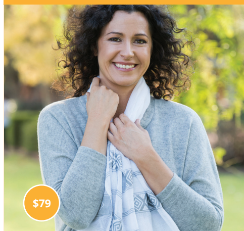
Queen Taitu Shawl (comes in 2 colours)