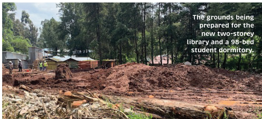
The grounds being prepared for the new two-storey library and a 98-bed student dormitory.

These new spaces are urgently needed to cater for the increasing numbers of BSc and MSc midwifery students attending the College.