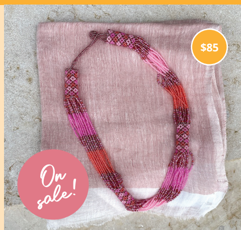
Mariam Scarf (Blush) & Zanele Necklace (Pink & Orange) Bundle