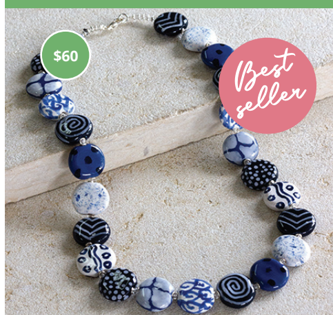
Kazuri Necklace (14 different colours)