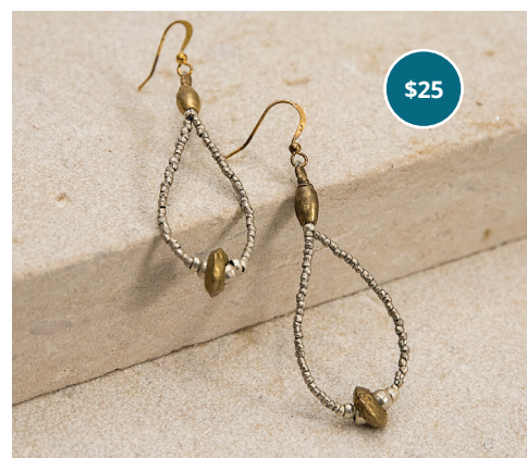
Selome Earrings (Silver and Brass)