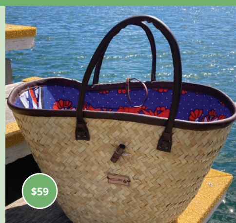
Kitege Market Basket with Leather Trim