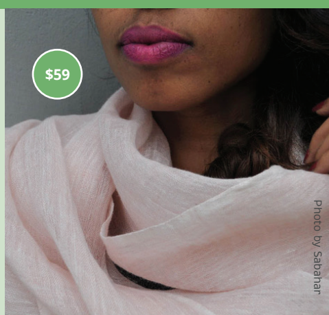
Mariam Scarf in Blush